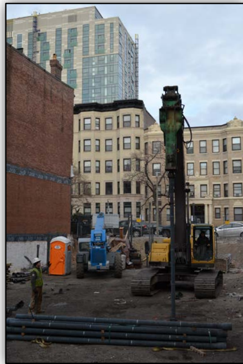
Figure 1: Ductile Iron Pile Installation

Ductile Iron Piles are installed using an excavator-mounted medium-sized percussion hammer fitted with a special drive adapter that advances the pile into the ground using a combination of percussive (ramming) energy from the hammer and excavator crowd force as necessary (Figure 1). The percussion hammer delivers high frequency driving energy to advance the pile. The high frequency vibration waves created by the pile installation are significantly lower amplitude compared with traditional driven pile operation. Additionally, the high frequency waves dissipate rapidly with distance from the energy source. Furthermore, the displacement of the soil generated by pile advancement is often much less because of the smaller cross-sectional area of the Ductile Iron Piles compared with driven H-piles, pipe piles or precast concrete piles. The end result is a driven pile system that results in minimal levels of vibration during driving.