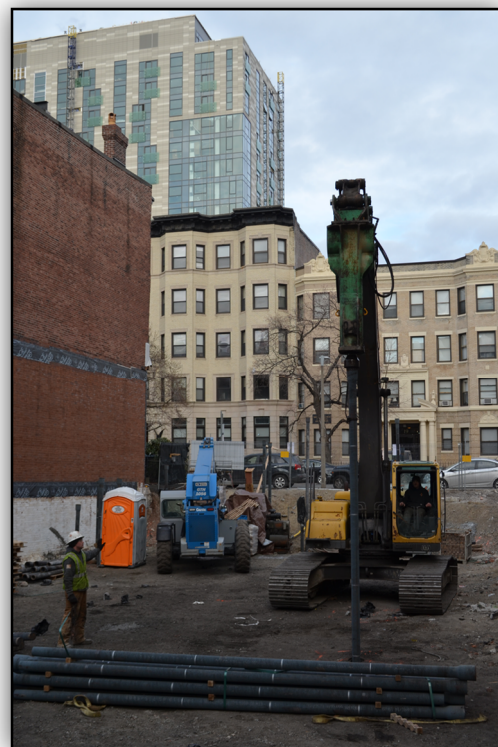
Figure 1: Ductile Iron Pile Installation

Ductile Iron Piles are installed using an excavator-mounted medium-sized percussion hammer fitted with a special drive adapter that advances the pile into the ground using a combination of percussive (ramming) energy from the hammer and excavator crowd force as necessary (Figure 1). The percussion hammer delivers high frequency driving energy to advance the pile. The high frequency vibration waves created by the pile installation are significantly lower amplitude compared with traditional driven pile operation. Additionally, the high frequency waves dissipate rapidly with distance from the energy source. Furthermore, the displacement of the soil generated by pile advancement is often much less because of the smaller cross-sectional area of the Ductile Iron Piles compared with driven H-piles, pipe piles or precast concrete piles. The end result is a driven pile system that results in minimal levels of vibration during driving.