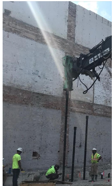
Figure 1: Ductile Iron Pile Installation

As shown in Figure 2, 2 inches/second often represents a damage threshold criteria for high frequency vibrations (USBM, 1980). Measurements of vibration levels during installation of Series 118 Ductile Iron Piles typically less than 1 in/sec at distances as close as 2 feet from the installation location. These low vibration levels further diminish rapidly with distance from the energy source and are typically less than 0.5 in/sec at distances of 5 feet from installation and less than 0.2 in/sec at distances of 10 feet based on field measurements, as shown in Figure 3.