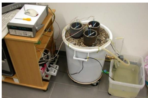
Figure 3: Picture of Lab Test Setup