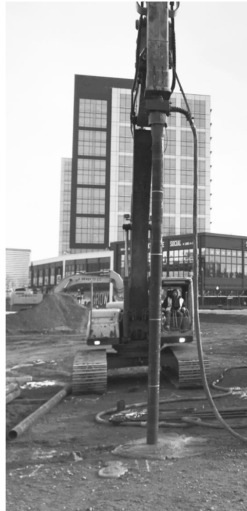
Figure 6: Ductile Iron Pile Installation

Ductile Iron Piles have been used in European foundation construction for more than two decades and are increasingly used in the United States and Canada as a cost-effective foundation system with rapid installation rates. Independent research shows that the Ductile Iron Piles provide superior protection against corrosion and performs better in side-by-side comparisons with various steel products. The favorable corrosion characteristics are largely attributed to the casting skin that develops from the manufacturing process compared with the rolling skin in steel. Despite the high resistance to corrosion, Ductile Iron Pile design considers the effects of corrosion by including a percentage of "sacrificial" material (material loss) in the design capacity and / or by grouting (encapsulating) a portion or all of the pile in grout.