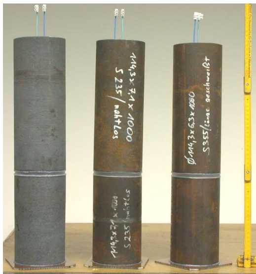
Figure 1: Picture of Samples prior to Testing

The testing found that the high-temperature casting annealing skin created as a part of the Ductile Iron Pile manufacturing process covers and adheres to the pile surface and provides superior protection to the metal beneath. The results show that this casting skin is dense and well-adhering to the piling. The integrity of the skin as well as its protective nature is evidenced by the lack of pebbles adhering to the pile surface in Figure 5. In the upper oxygen-rich portion of the test setup, the number of locations forming corrosion products in crevices between the pile surface and the pebble were few.