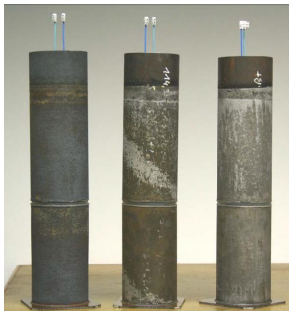
Figure 5: Picture of Samples after Testing (post-cleaning)

In summary, the Ductile Iron Pile exhibits superior corrosion protection. The ductile pile material performed better than steel in the simulated corrosive environment with only localized areas of corrosion product and shallow pitting – a vast difference compared to the overall performance of the steel sections.