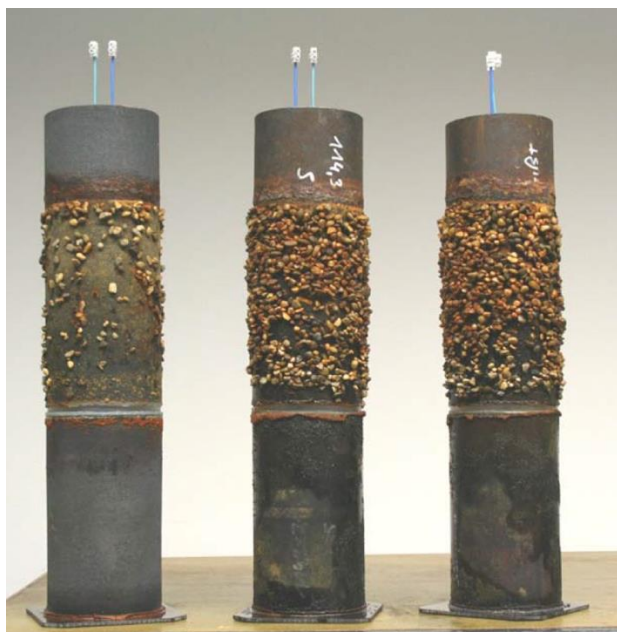
Figure 4: Picture of Samples after Testing (pre-cleaning)

In contrast, the steel samples behave as an actively corroding metal. The rolling skin from the manufacturing process offered far less protection than the Ductile Iron casting, resulting in a more wide-spread pattern of corrosion evidenced by the nearly complete coverage of pebbles to corrosion locations (Figure 5). The development of this corrosion layer does have a benefit by acting to reduce the access to oxygen and reduce continued corrosion with time only after substantial corrosion has occurred. The presence of the electrical current created by coupling with the upper section intensified the corrosion and the dissolution of the rolling skin in the lower portion.