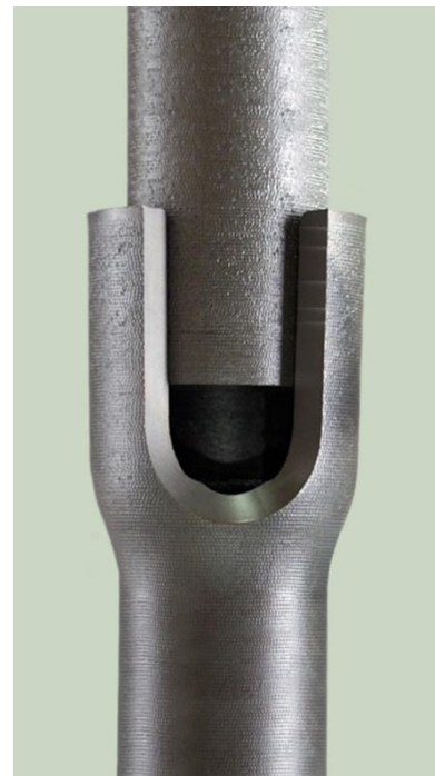
Figure 1: Plug and Drive Connection

Ductile Iron Piles are manufactured in three diameters: 98 mm (3.89 in), 118 mm (4.65 in) and 170 mm (6.70 in) with different pile wall thicknesses that range from 6.0 mm (0.24 in) to 13.0 mm (0.51 in). The strength and stiffness properties for design include a yield stress of 320 MPa (46.4 ksi) and an elastic modulus value of 170,000 MPa (24,600 ksi). Additional material properties and dimensions for the different pile sizes documented by the manufacturer (Tiroler Rohre, GmbH) are available in the Ductile Iron Pile Spec Sheet .