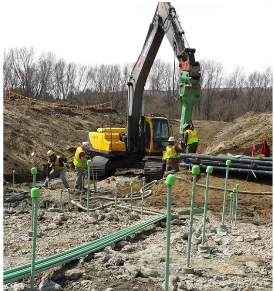
Figure 4: Installed Ductile Iron Piles for Tension

Results of tension load tests performed at two different sites on exterior-grouted friction Ductile Iron Piles are shown in Figure 5. Both piles were installed with Series 170 Ductile Iron Piles with a 270 mm (10.6-in) grout shoe to install an approximate 10.6-in diameter grouted displacement pile. Test Pile #1 used a 7.5 mm wall thickness, while Test Pile #2 used a 9 mm wall thickness. Both piles were installed to approximately 32 feet (2 full 5-meter sticks). A 1-3/4 inch, Grade 150 ksi threadbar was inserted in each pile to provide the tensile resistance. Soil conditions at these sites were generally loose to dense sand. A 4-ft thick organic layer was encountered between depths of 6 and 10 feet in Test Pile #1. Both piles performed similarly with about 0.5 inch of movement at loads approaching 300 kips.