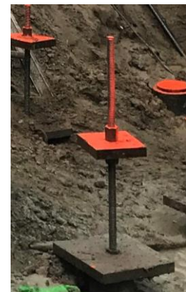
Figure 3: Top-of-DIP Detail

The tensile load transfer from the Ductile Iron Pile to the pile cap requires the thread bar extend into the pile cap. A tension plate is commonly attached to the top of the bar. The plate width is designed to minimize pile cap concrete stresses, while the plate thickness is designed to provide acceptable bending resistance of the plate. Structural connection details between the Ductile Iron Pile and the pile cap require coordination between the project Structural Engineer of Record (SEOR) and the Ductile Iron Pile designer.