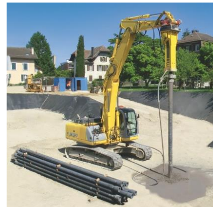
Figure 1: Ductile Iron Pile System

Piles are available in multiple diameters ranging from 98 mm (3.9 in) to 170 mm (6.7 in) and wall thicknesses ranging from 6 mm (0.24 in) to 13 mm (0.51 in) allowing for the most efficient and cost-effective designs. For friction piles, grout shoes range in diameter from 150 mm (5.9 in) to 370 mm (14.6 in). The variable diameters and wall thicknesses provide piles with structural working compression capacities ranging from 25 tons to greater than 120 tons. Ductile Iron Piles, outfitted with a center reinforcing bar, can also develop tension resistance. Allowable tension capacity depends on the installation method (dry or wet), soil conditions, and the center bar size and strength. Capacities typically range from 10 tons to greater than 75 tons.